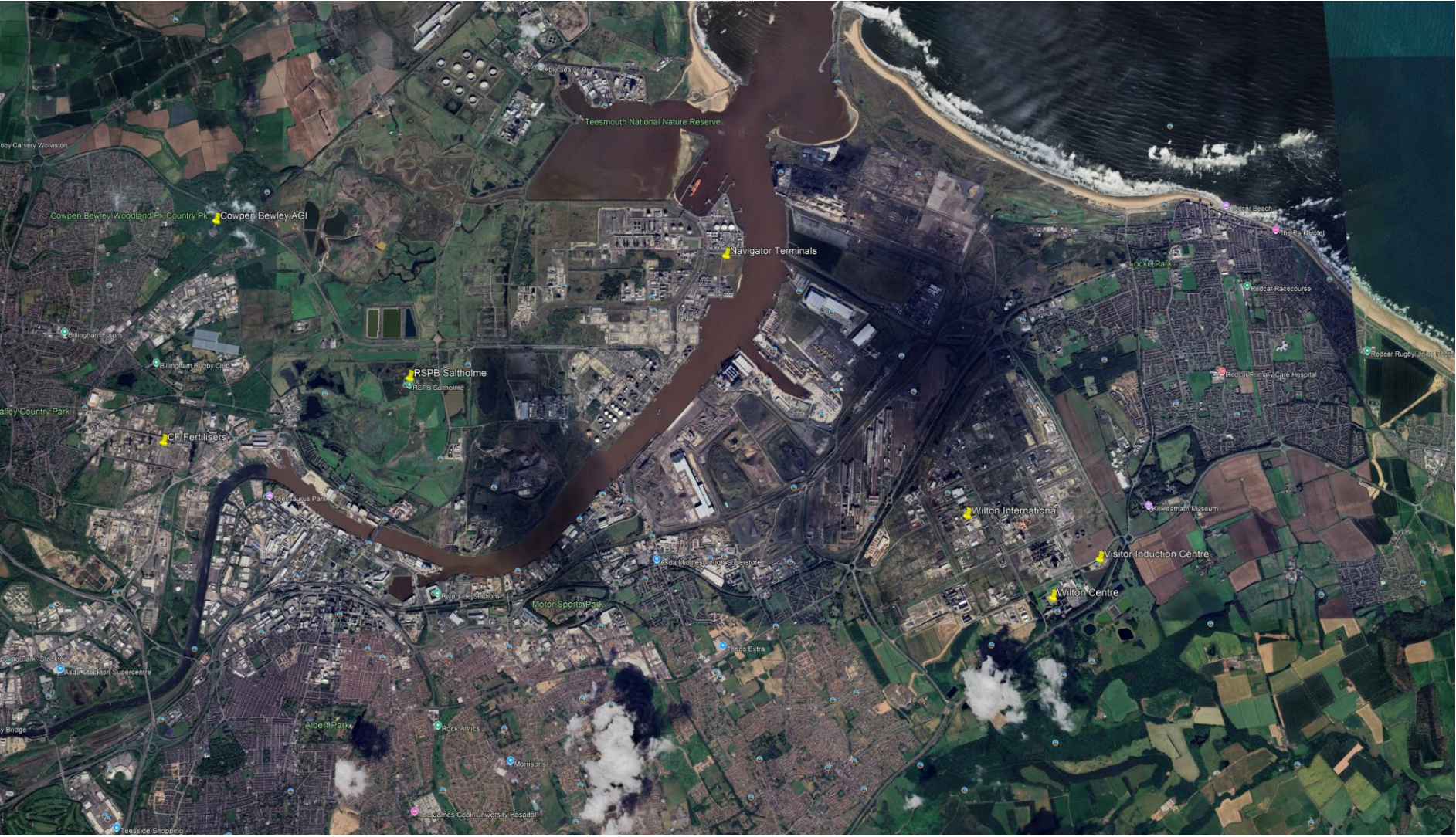
Figure 1.1: Map showing suggested ASI3 Locations